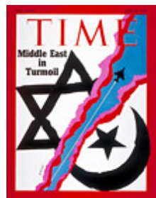
▶ June 22, 1970